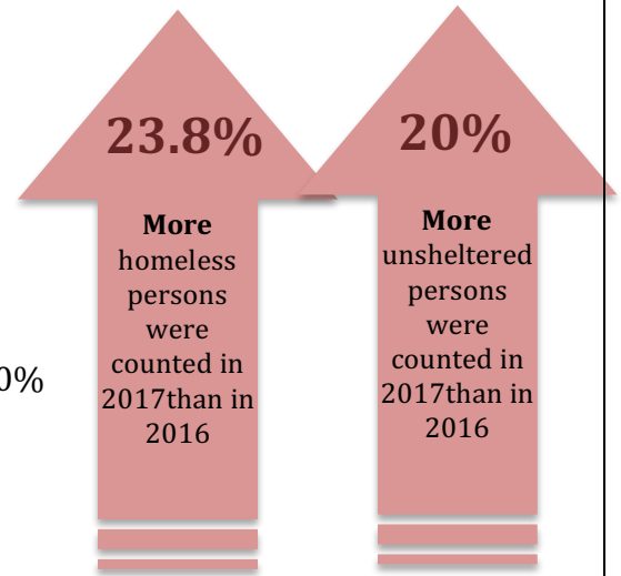
Fig. 1. 5-Year Comparison of Total Homeless Population by Housing Situation